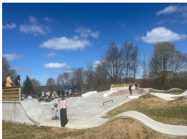
A beautiful April day for the Elverson Skate Park and Pump Track opening.