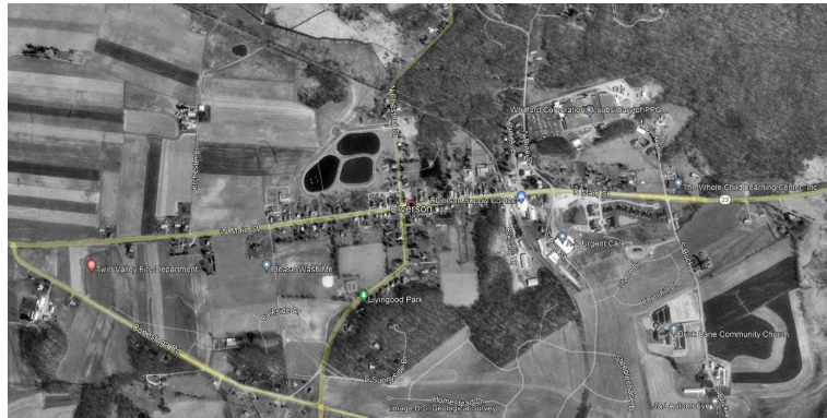
Elverson in 1992—population 466.

The resistance to growth may serve a community well for a generation but will be detrimental to the next. In all communities, humans are the greatest and most valuable resource.