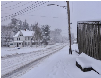
Main in Elverson— Feb 2024

PRST STD US POSTAGE PAID READING, PA PERMIT #415