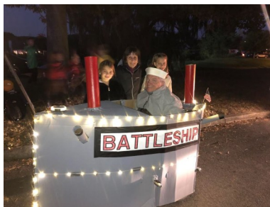
2024 Parade Best of Show

ment pot trees on Main. Not a decorator, I have done nothing except to think about this December. If this is your vision as well, let me know. Perhaps we can do it together.