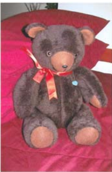
THE BLUE ROCK BEAR