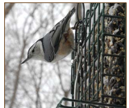
Left to right, then down: White-throated Sparrow, Downy Woodpecker, Carolina Wren, White-breasted Nuthatch

Send your Elverson news and stories to our editor at brenda@stoltzfus.com by February 15 or call her at 610.286.5115. Newsletters can be found on www.elversonboro.org .